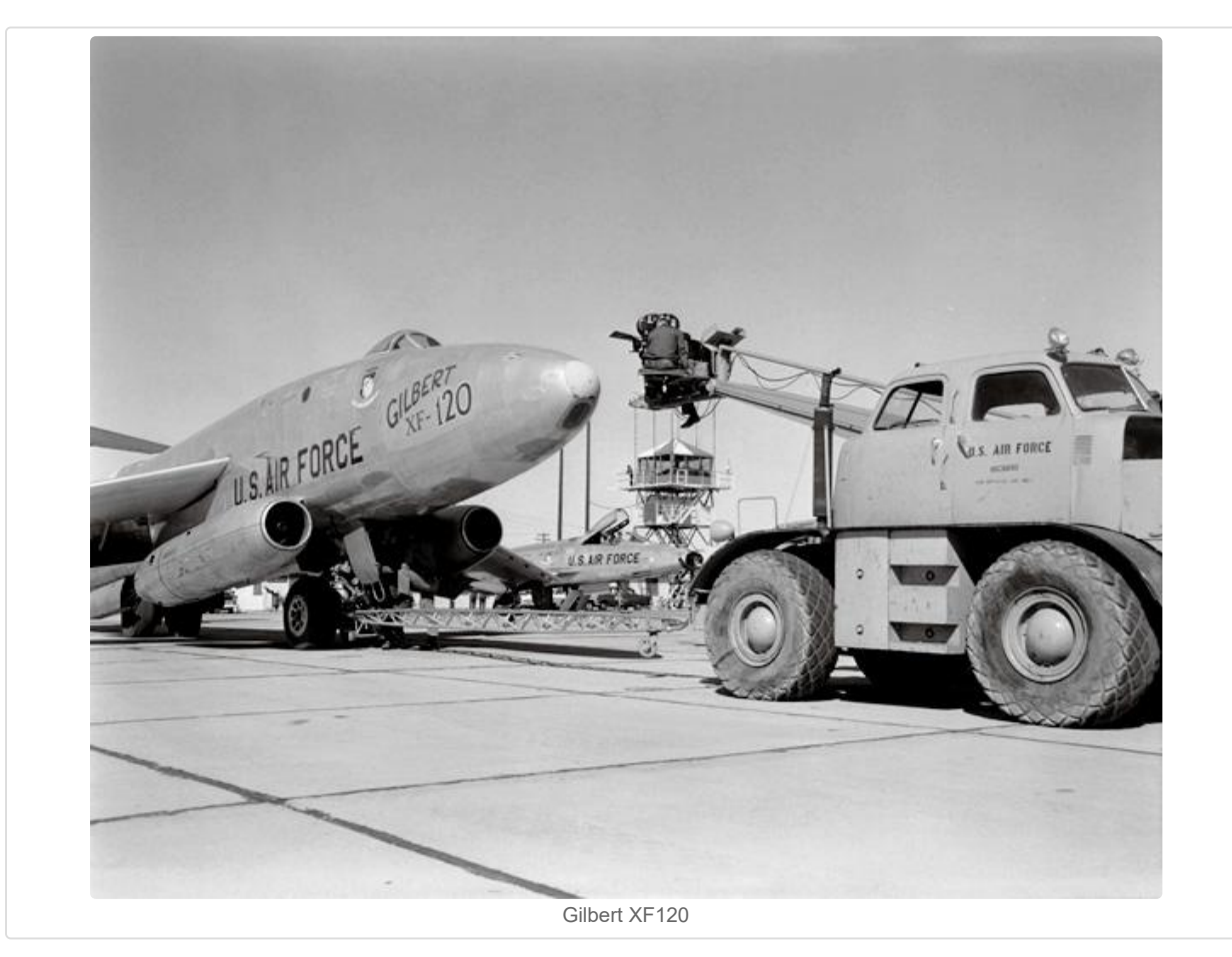
October 27th, 2012 | Category: Toward The Unknown, XB-51 | Comments are closed

The November 2012 issue of Air & Space magazine has a article about planes that only existed in the movies. Check out the writeup on Toward The Unknown's own Gilbert XF-120 .