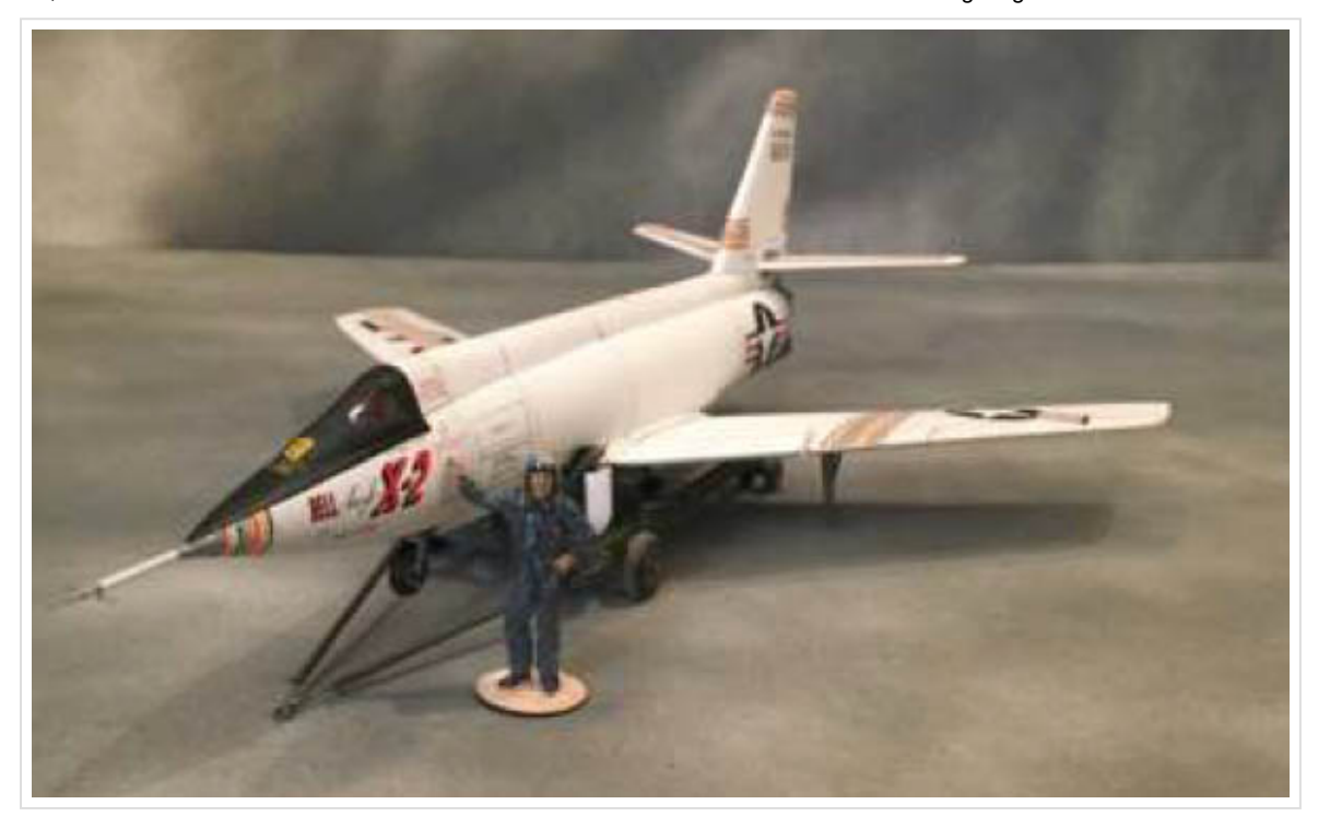
January 24th, 2021 | Tags: models, pete everest, X-2 | Category: Pete Everest, Test Pilots | Comments are closed